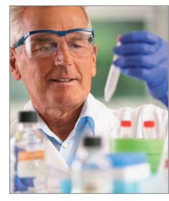
Pharmaceutical and chemical industry