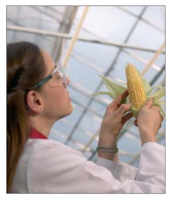
Food, feed and beverage industry

The NDA 701 is extremely versatile, being suitable for nitrogen and protein determination in several kinds of sample, in accordance with official AOAC, AACC, ASBC, ISO and OIV methods.