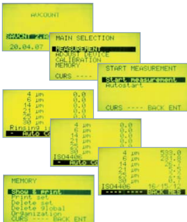
AUTOMATIC OPERATION & EASY TO FOLLOW MENU SYSTEM