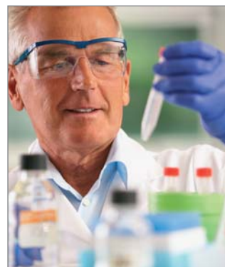
Pharmaceutical and chemical industry