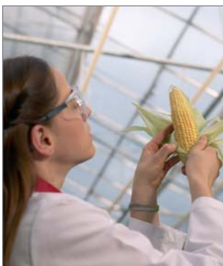
Food, feed and beverage industry

The NDA 701 is extremely versatile, being suitable for nitrogen and protein determination in several kinds of sample, in accordance with official AOAC, AACC, ASBC, ISO and OIV methods.