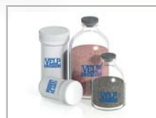
Long-life VELP Consumables

Minimum Maintenance Monitoring of consumables, no daily calibration, no use of corrosive chemicals.