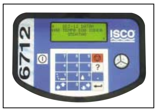
The 6712 Controller is an SDI-12 logger. Manual pump operations are now located on the front panel keys.

Fax: (402) 465-3022 E-Mail: info@isco.com