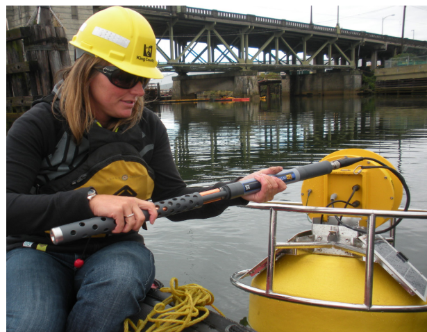
EMM68 Buoy supports a single water quality instrument, such as a YSI EXO or 6600 V2-4 Sonde, positioned inside the subsurface pipe

Contact YSI's Integrated Systems & Services division to discuss your specific monitoring application. We offer a variety of buoy platforms which can be tailored to fit your needs. Our other systems are suited for deployment in high-energy environments and for long-term monitoring projects